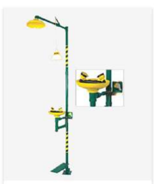
Eyewash & Safety showers