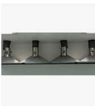
SS Canopy Hood